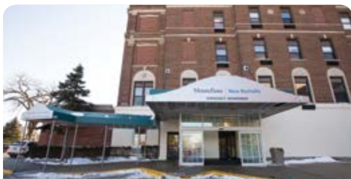
Montefiore New Rochelle