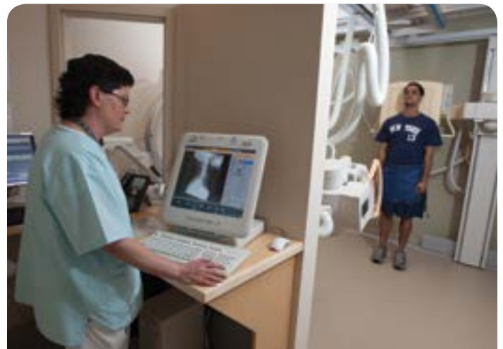
A patient prepares for x-rays at Montefiore