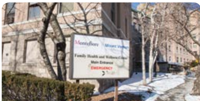
Montefiore Mount Vernon

To support Montefiore Mount Vernon, please visit www.givetomontefiore.org/mv . To support Montefiore New Rochelle, please visit www.givetomontefiore.org/nr or visit Accents on Antiques, 125 Wolfs Lane Pelham, New York, 10803, 914-637-1195. To learn more about how you can get involved, please contact Bess Chazhur at bchazhur@montefiore.org or 718-920-5970.